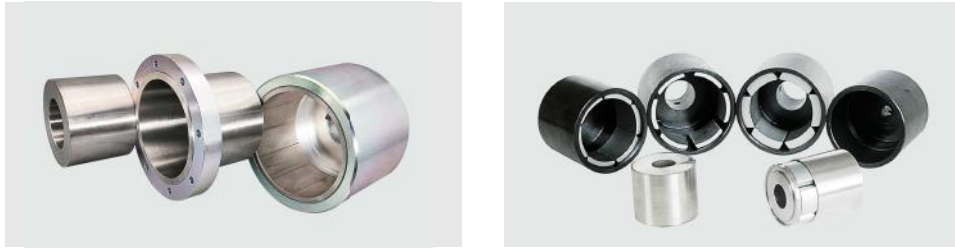
MCM (0.1~10NM) 磁性联轴器 MCM (0.1~10NM) Magnetic Coupling